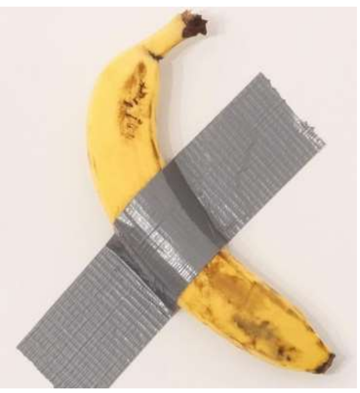
Pictured: The Comedian by Maurizio Cattelan, taken from the Art Basel Miami Beach's Twitter page.