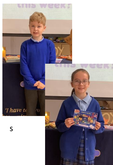
Year 3 award winners