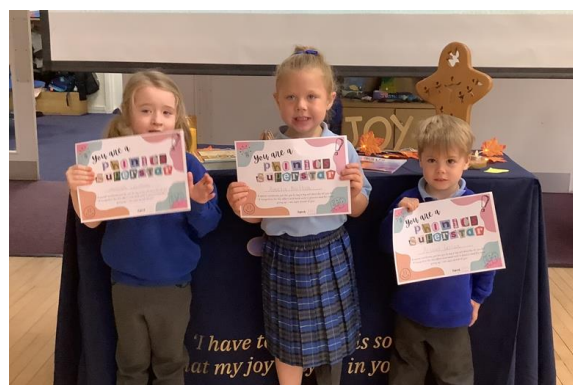
Reception class award winners