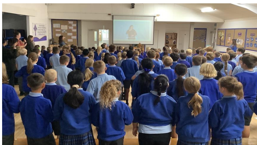
Year 6 winners

Today was a special day across Blackburn Diocese. All schools within this Christian school family are invited to say or sing The Lord's Prayer as part of their worship. We sang a Makaton version of it at the close of our joyful Celebration Worship!