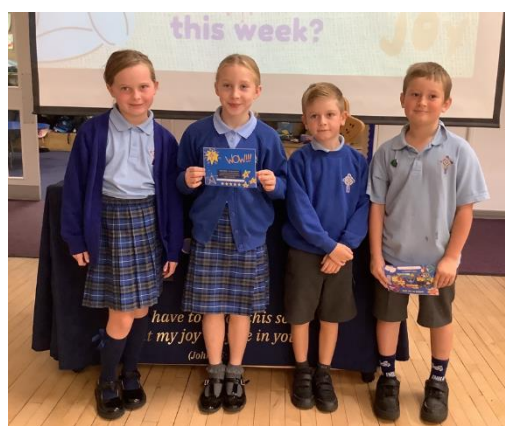
Year 4 award winners