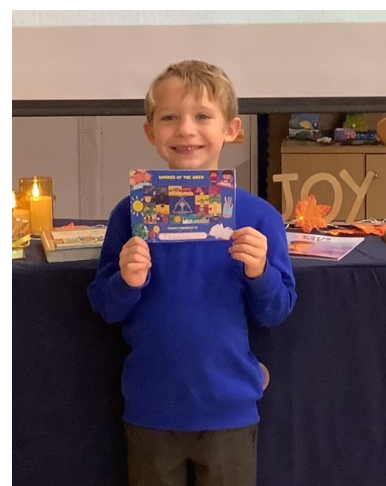
Year 2 award winner