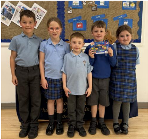
Year 2 award winners