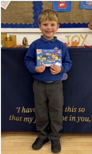
Reception class award winner