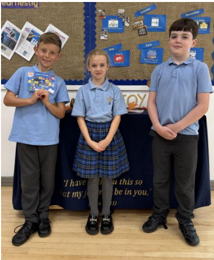
Year 4 award winners