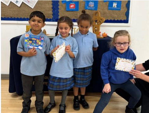
Year 1 award winners