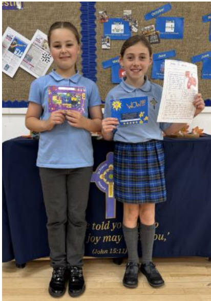
Year 5 award winners