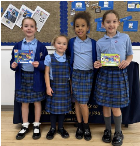
Year 3 award winners