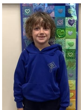
Y2 Award winners