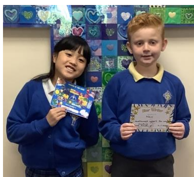
Y4 Award winners