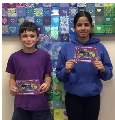
Y5 Award winners