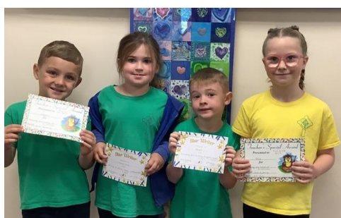
Y1 Award winners