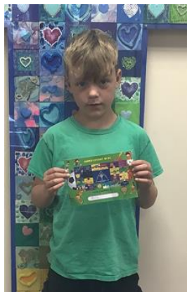
Y3 Award winner