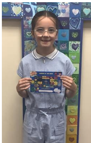
Y2 Award winner