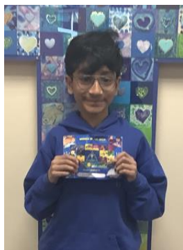
Y6 Award winner