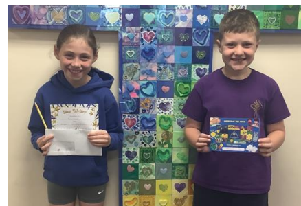
Y4 Award winners