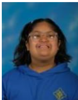
Y5 Award winner