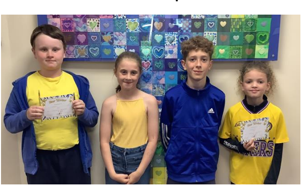
Y2 Award winner