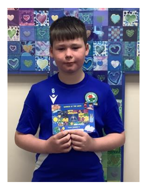
Y3 Award winner