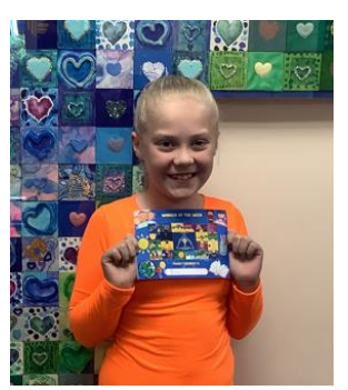
Y1 Award winners