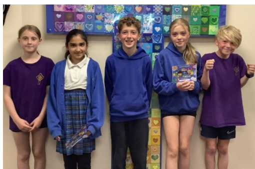
Year 5 Award Winners