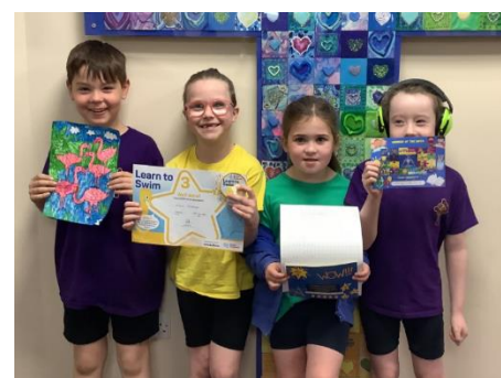
Y1 Award winners