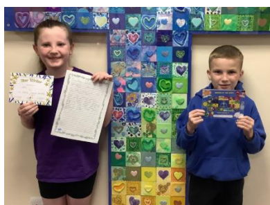
Y2 Award winners