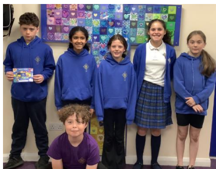
Year 6 Award Winners