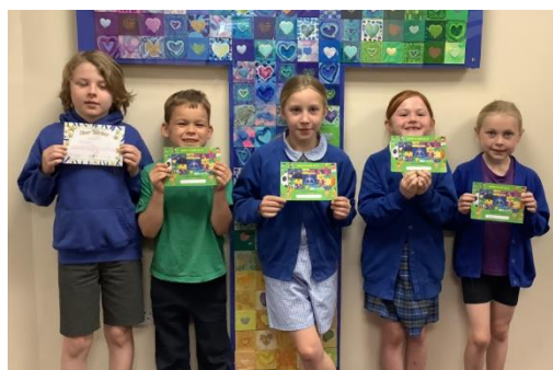
Y3 Award winners