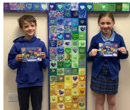
Year 4 Award Winners