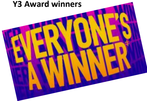
Y3 Award winners