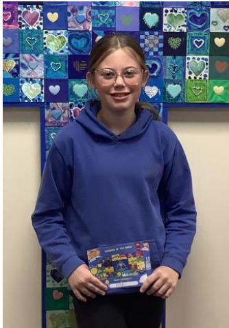
Year 6 Award Winner