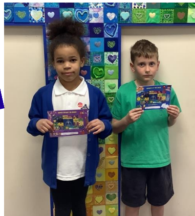
Y2 Award winners