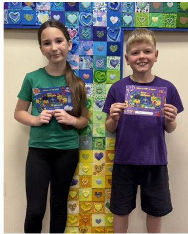
Year 5 Award Winners