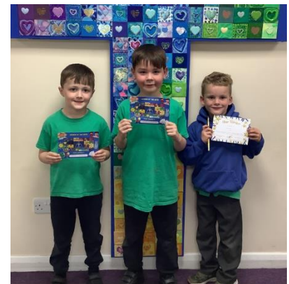
Y1 Award winners