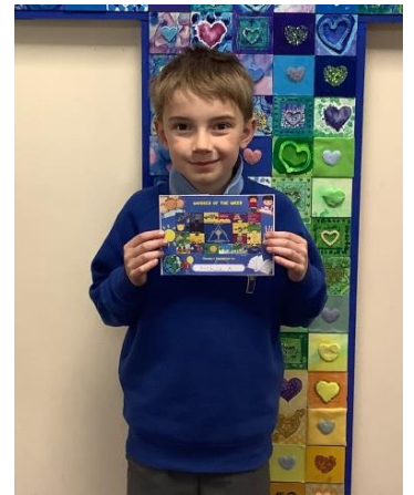
Year 4 Award Winner