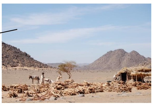
The Sahara Desert is hot.