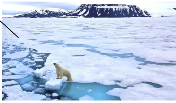
The Arctic is cold.